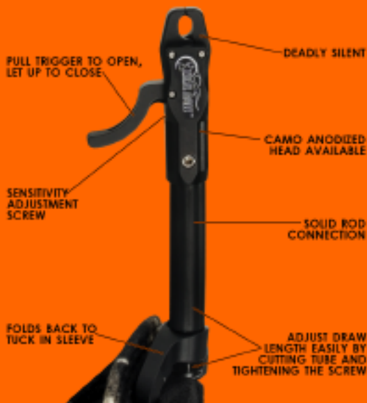
STINGER (TSBR-BK-L) Buckle / Black / Large

WARNING: This product can expose you to chemicals including Nickel Acetate, which is known to the State of California to cause cancer or birth defects or other reproductive harm. For more information, visit www.P65Warnings.ca.gov .